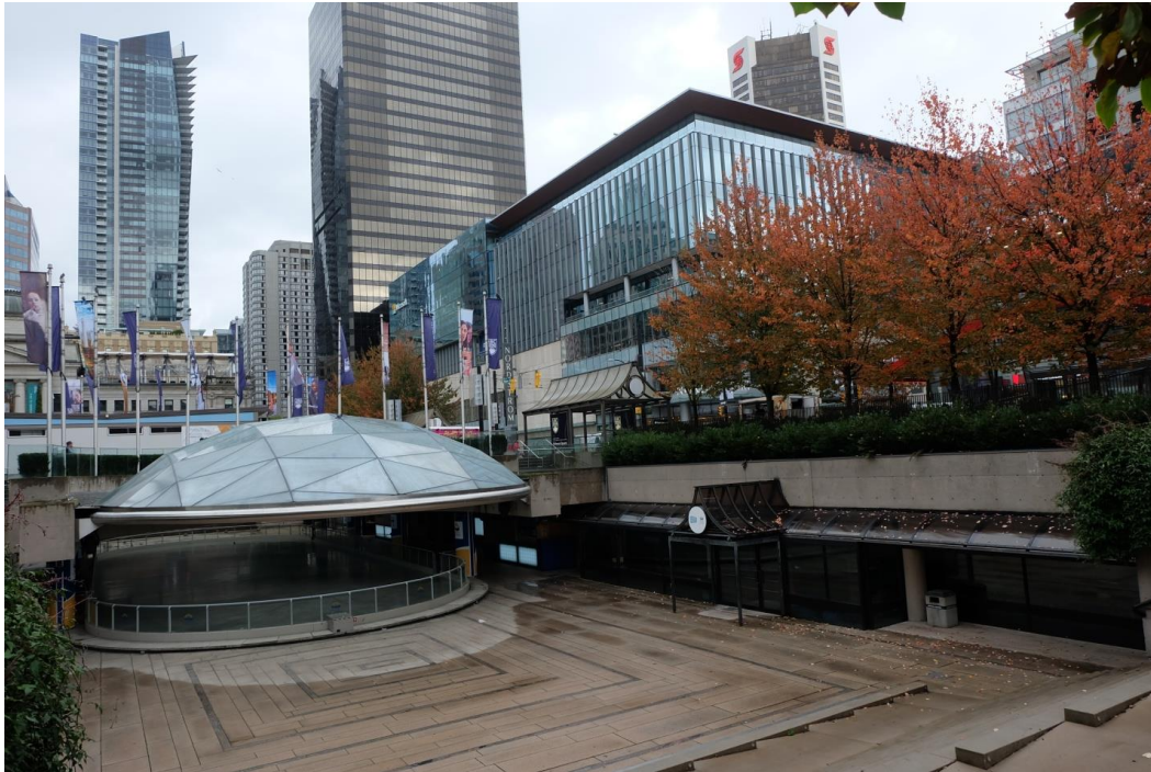
Hosting Room entrance visible on the right.

The B.C. Hosting Space is situated at the South East corner of the Robson Square Plaza level (one level below street surface).