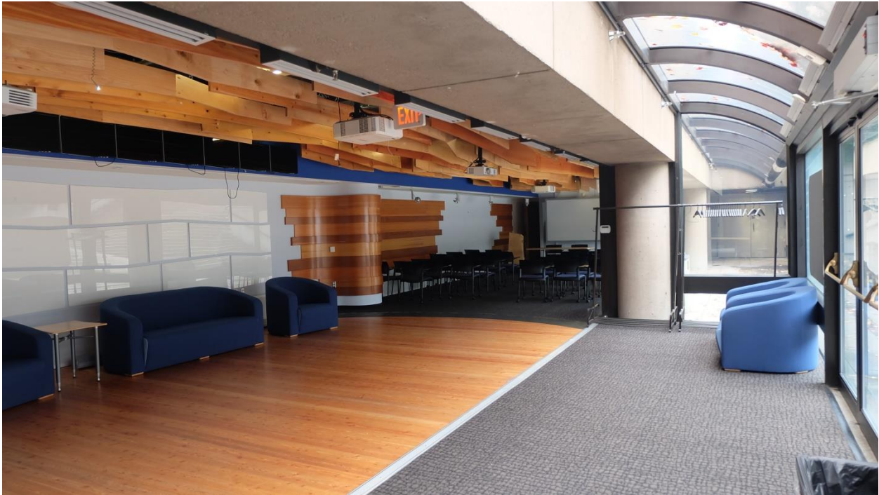
Hosting room interior